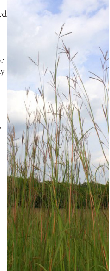
Big Bluestem - Jill Haukos

Until recently Kings Creek was dry and we were unable to do our Stream Macroinvertebrate education exercise due to the lack of water. Stream researchers were struggling to find sites along the creek that were suitable for their data collections. The creek started running again after the repeated rains of July. It was even reported that the water started flowing through the Spring House of the Hokanson Homestead – just as initially intended by the Hokanson family. Water flowed into the stone basin through one hole and