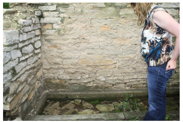
Hokanson spring trough

When was the last time you saw water in Hokanson Homestead spring house?