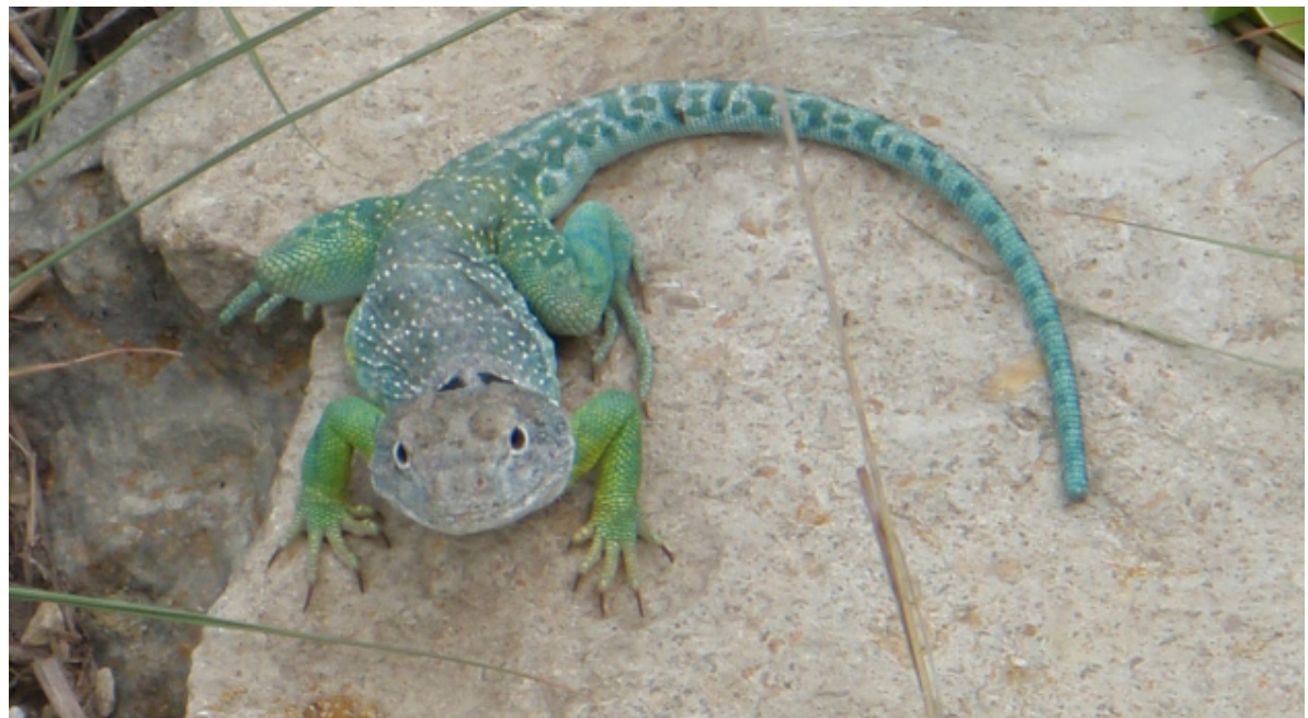
Collared lizard

This summer the wildlife on Konza has been as fascinating, as always! I'm glad I got to see a small portion of it firsthand.