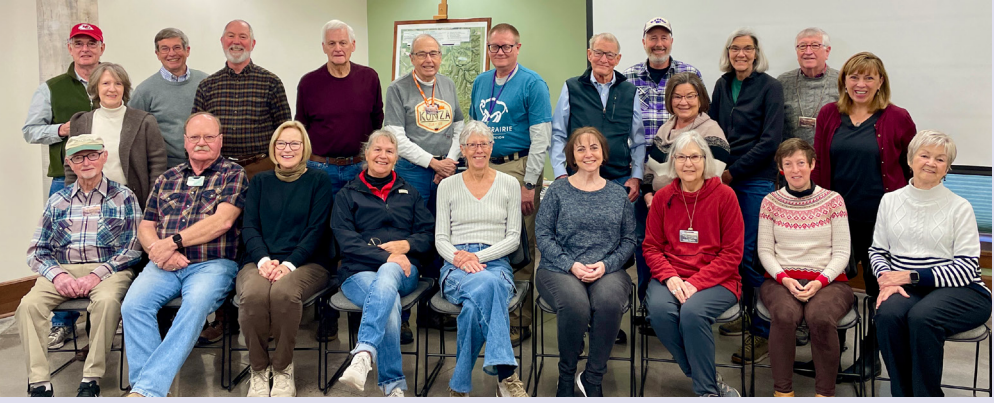
The 2023 KEEP Docents