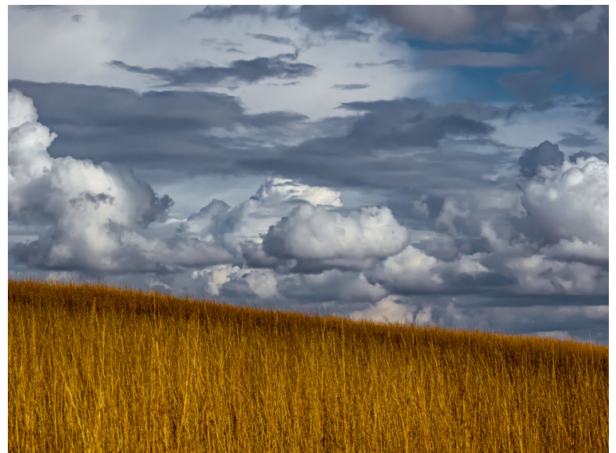
"Tallgrass to Sky" by Ken Sabatini.)