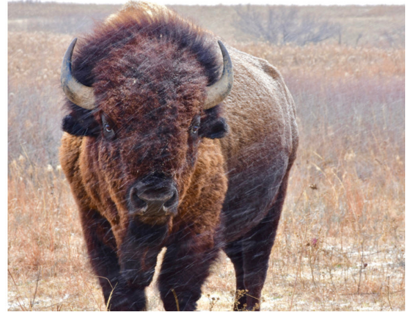
"Snowy Stare-down"