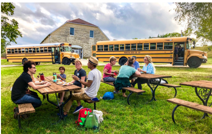
FOKP Annual Meeting- 2019

Awardees receive a piece of Konza Prairie itself – a unique piece of limestone from the bison area that is engraved and painted with the Konza Prairie Biological Station logo. No one piece is the same.