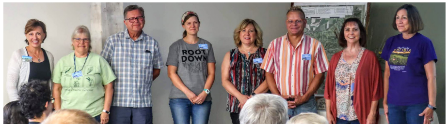
2019 Docent Class- Annual Meeting Graduation