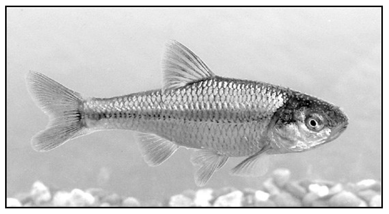
Topeka Shiner, Photo by Konrad Schmidt

One of the largest threats to Topeka shiners in Flint Hills streams is the construction of dams and the subsequent stocking of predatory sport fish such as the largemouth bass. Therefore, the objective of my graduate research is to evaluate the effect of predation by largemouth bass on Topeka shiners and some of the other more common minnow species inhabiting Flint Hills streams. I will use the experimental streams at the Konza Prairie Biological Station to answer the following questions: 1) are Topeka shiners more susceptible than other native fishes to predation by largemouth bass? and 2) does the