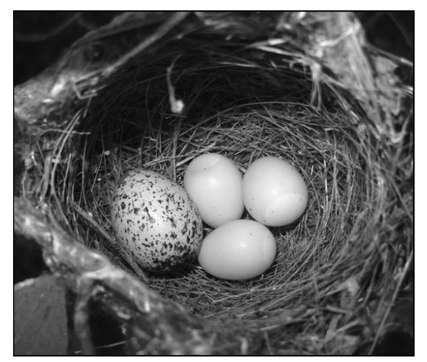
A parasitized nest containing three Bell's Vireo eggs (small eggs) and one Brown-headed Cowbird egg (large egg).

My research on Konza focused on determining if Bell's Vireos can recognize cowbird eggs as different from their own, and to what extent cowbird parasitism reduces vireo reproductive success. I have discovered that vireos do not recognize cowbird eggs and use other cues to abandon nests and that cowbird parasitism has population level consequences for vireos breeding on Konza. On average, vireos do not produce enough young to replace themselves, despite seasonal declines in parasitism. Most losses are due to parasitism, but predation by snakes and mammals also contributes to the low nest success. Despite the poor productivity on Konza, cowbird parasitism is less common elsewhere in the vireo's breeding range and reproductive success is likely much higher.