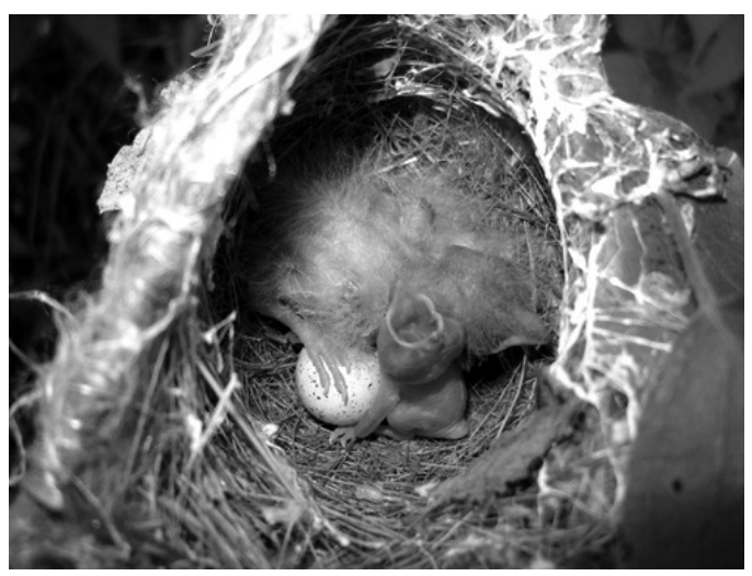
A parasitized nest that contains one large Brown-headed Cowbird chick and one small Bell's Vireo chick. The cowbird hatched three days before the vireo and acquires most of the food brought back to the nest by the parents. Eventually, only the cowbird will remain.