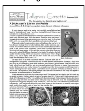
TGG Summer 2008

Beginning with the next issue, in 2011, you will receive this newsletter electronically via e-mail. In addition to saving money and paper, enjoy the Gazette in color! You can always find the Tallgrass Gazette archived on-line, http://keep.konza.ksu.edu/docents/newsletter.htm.