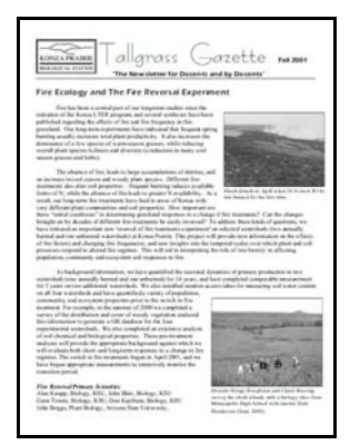
TGG Fall 2001

Thank you to its many contributors, who make the Gazette a quality publication!