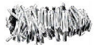
Caddisfly case of twigs